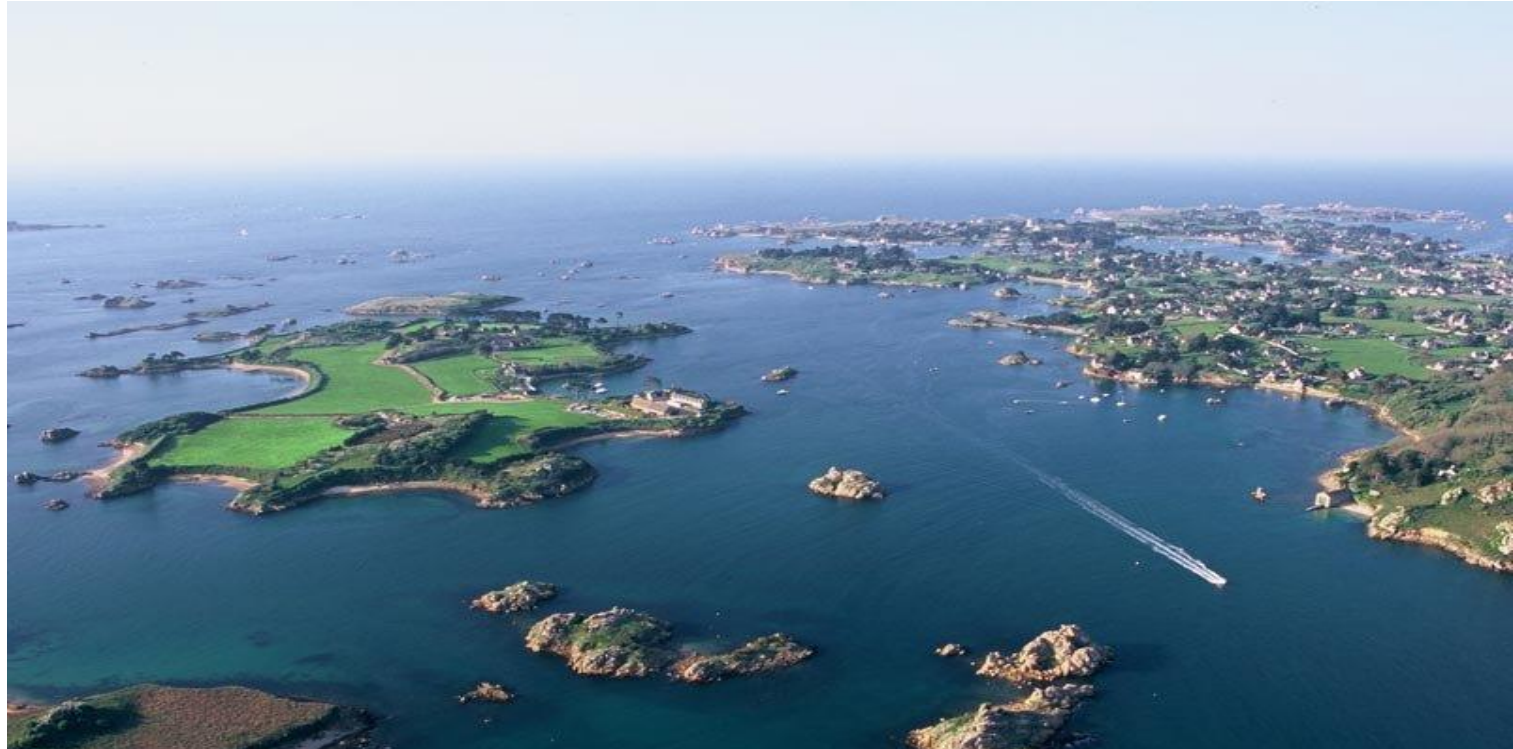
Bréhat Archipelago, Brittany