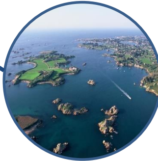
Bréhat Archipelago, the Ocean lung

The Gulf Stream originates from sea bathing the Amazon forest and like a vital artery it crosses the Atlantic Ocean, ending in the sea of the Bréhat Archipelago .