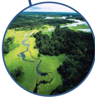
Amazonia forest, The Earth lung