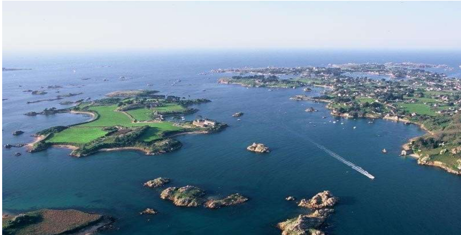
Bréhat Archipelago, Brittany