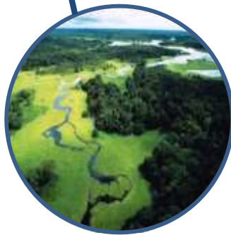
Amazonia forest, The Earth lung