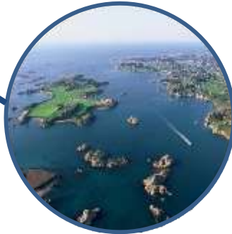
Bréhat Archipelago, the Ocean lung

The Gulf Stream originates from sea bathing the Amazon forest and like a vital artery it crosses the Atlantic Ocean, ending in the sea of the Bréhat Archipelago .